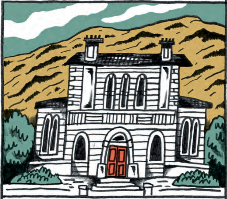
The package arrives safely and is handed to scientists at the Colonial Museum in Wellington.