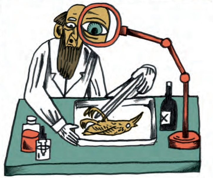
The ornithologist Sir Walter Buller confirms that it is a previously unknown species of bird.