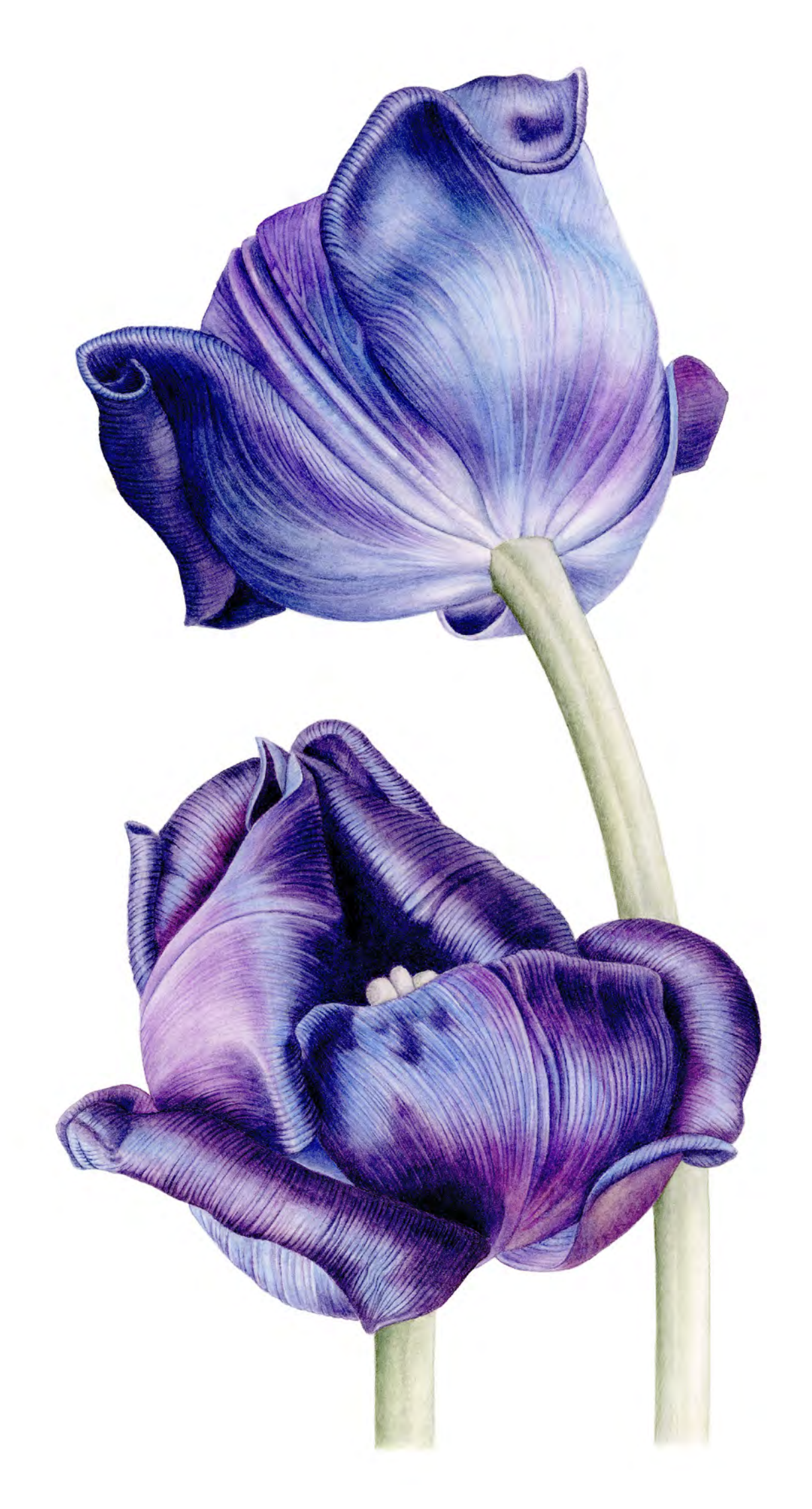
Tulips I, 2018, watercolor, 9" × 14"