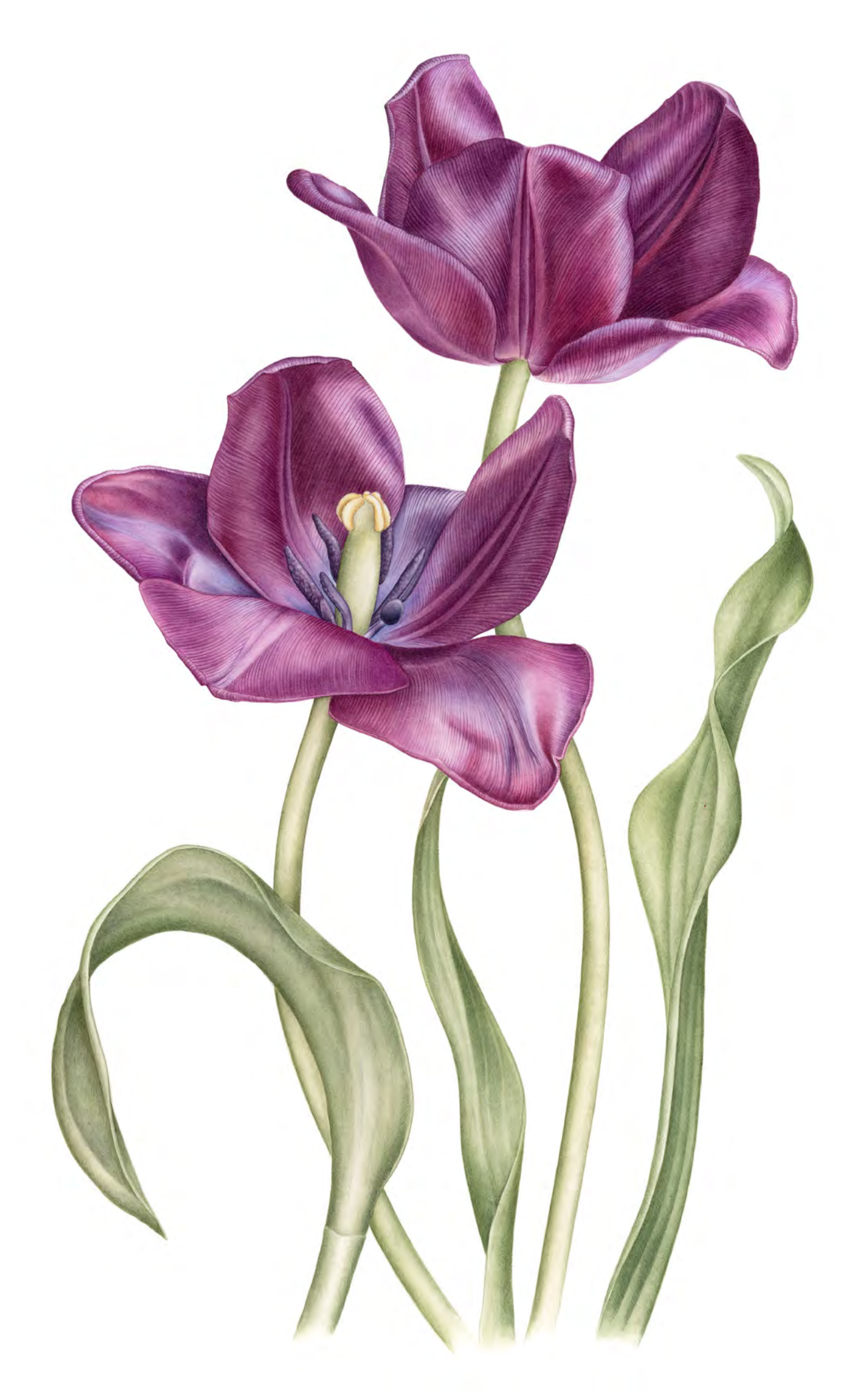
Tulips II, 2018, watercolor, 14'' \times 20''