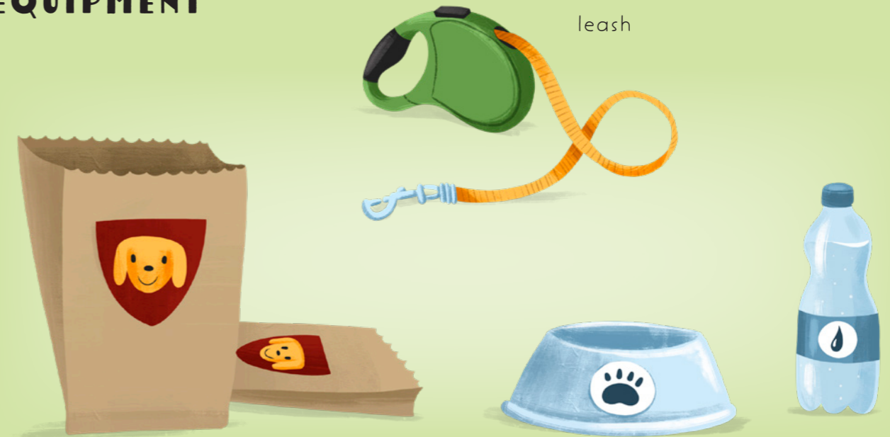
dog poop bags