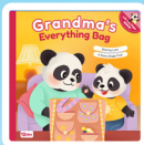
Grandma's Everything Bag