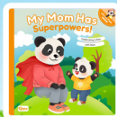
My Mom Has Superpowers!