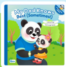
My Dad Knows Best (Sometimes!)

This product complies with EN 71 Parts 1-3 and ASTM F963-23 safety standards, ensuring the highest level of safety and quality for children.