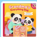
Grandma's Everything Bag