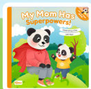
My Mom Has Superpowers!

This product complies with EN 71 Parts 1-3 and ASTM F963-23 safety standards, ensuring the highest level of safety and quality for children.