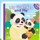
My Grandpa and Me